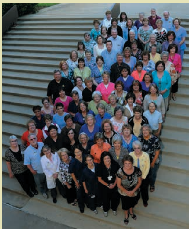
College of Dentistry staff with 20 years or more of service.

Without our great staff, the College of Dentistry would not be what it is today. This small tribute to our staff is our way of saying THANK YOU!!!