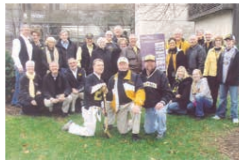
Dental Alumni Board members and friends at the site of the Dental Science Building addition before construction began in spring 2010.

So again, THANK YOU to our alumni, faculty and staff, patients, and friends for all your interest, loyalty, and generous support! The success of the building transformation for both gifts and political support did not just happen. It came from decades of people believing "This is Our College!"